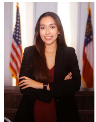
Maria Velasco Georgia Bar Success Endowed Award