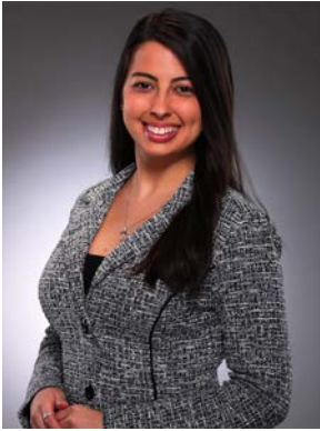
Jessica Cabrera Alumni and Donor Scholarship